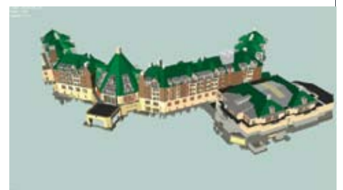
4D sequence clearly illustrates the building process to field workers and subcontractors