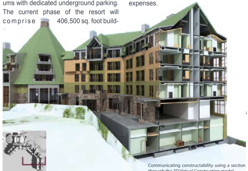
Communicating constructability using a section through the 3D Virtual Construction model

Due to the unusually heavy demands of this project, QDS was determined to find a sure-fire way to reduce errors, prevent delays, and minimize waste and expenses.